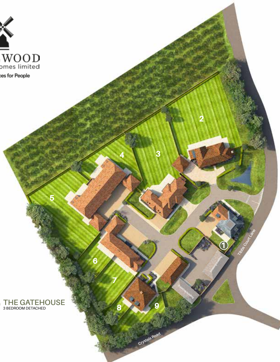
1 THE GATEHOUSE 3 BEDROOM DETACHED