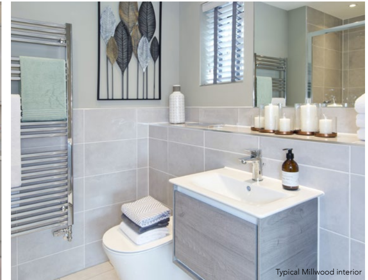
Typical Millwood interior