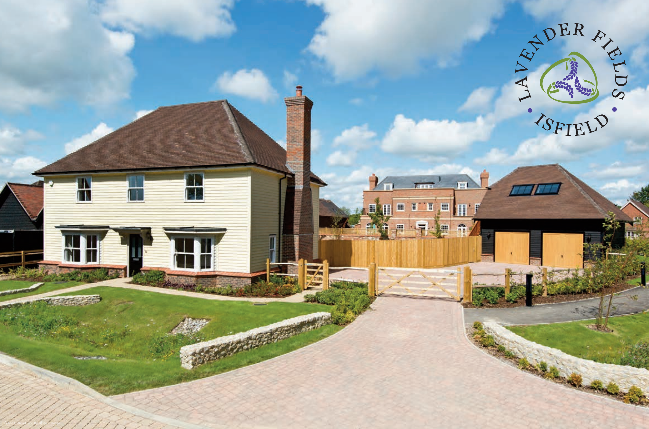
LINTON HOUSE - PLOT 26