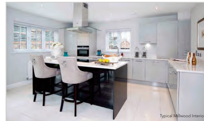
Typical Millwood Interior