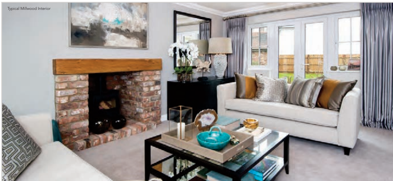
Typical Millwood Interior