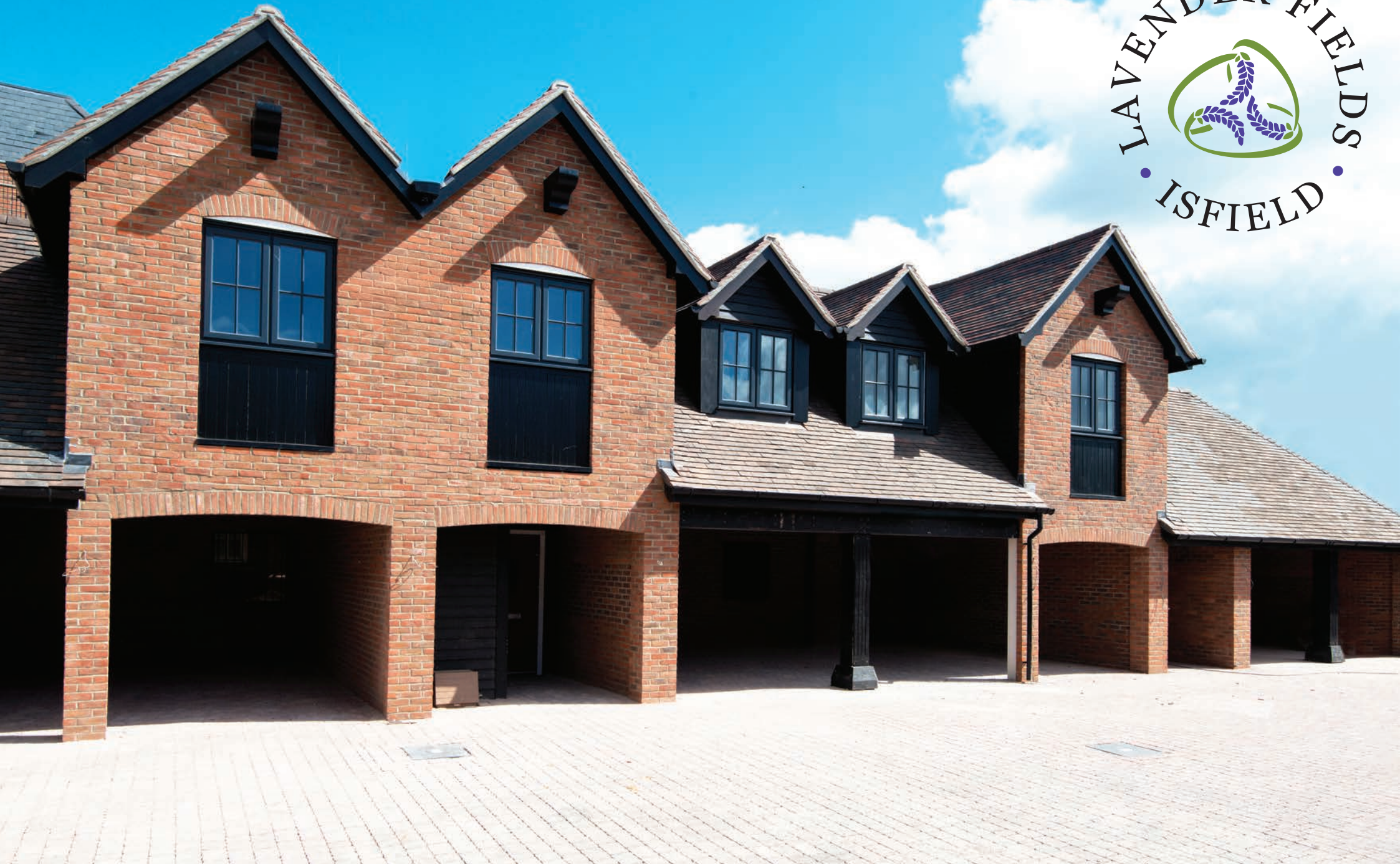
LAVENDERS KEEP - PLOT 32