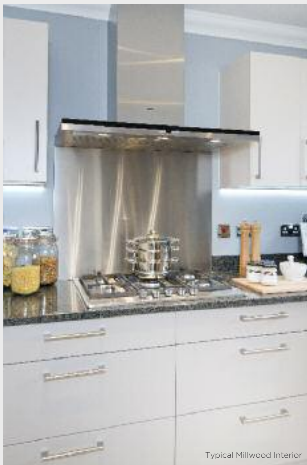
Typical Millwood Interior