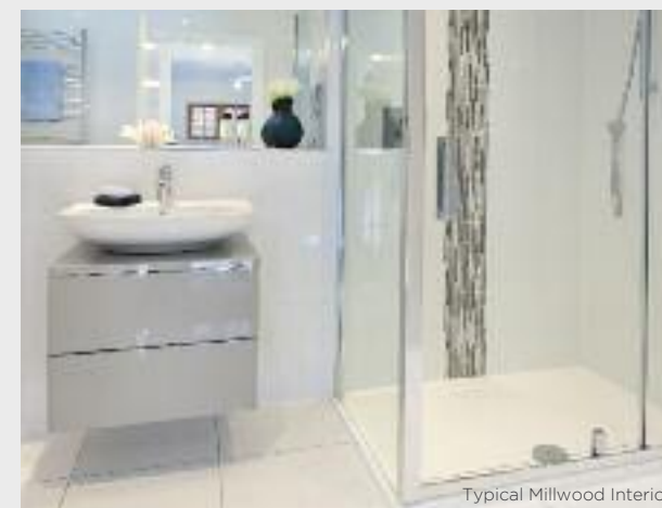
Typical Millwood Interior

This brochure has been produced for your guidance only. Whilst every care has been taken, its accuracy cannot be guaranteed. Millwood Designer Homes Ltd reserves the right to change the specification without prior notice. The photographs shown within this brochure are indicative of the quality of a Millwood Designer home and do not necessarily relate to the house types. *Internal photography of typical Millwood Designer Homes interiors.